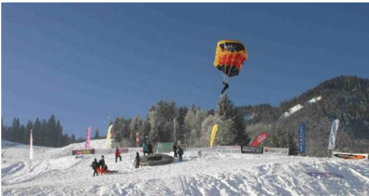
Competition Area for Parachuting