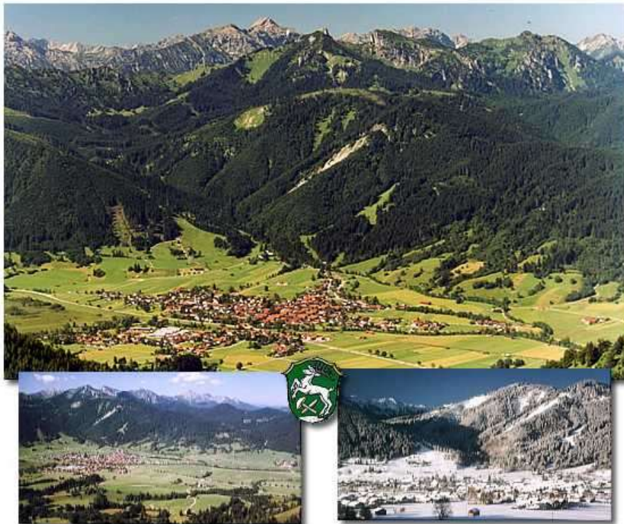
Location of the Event